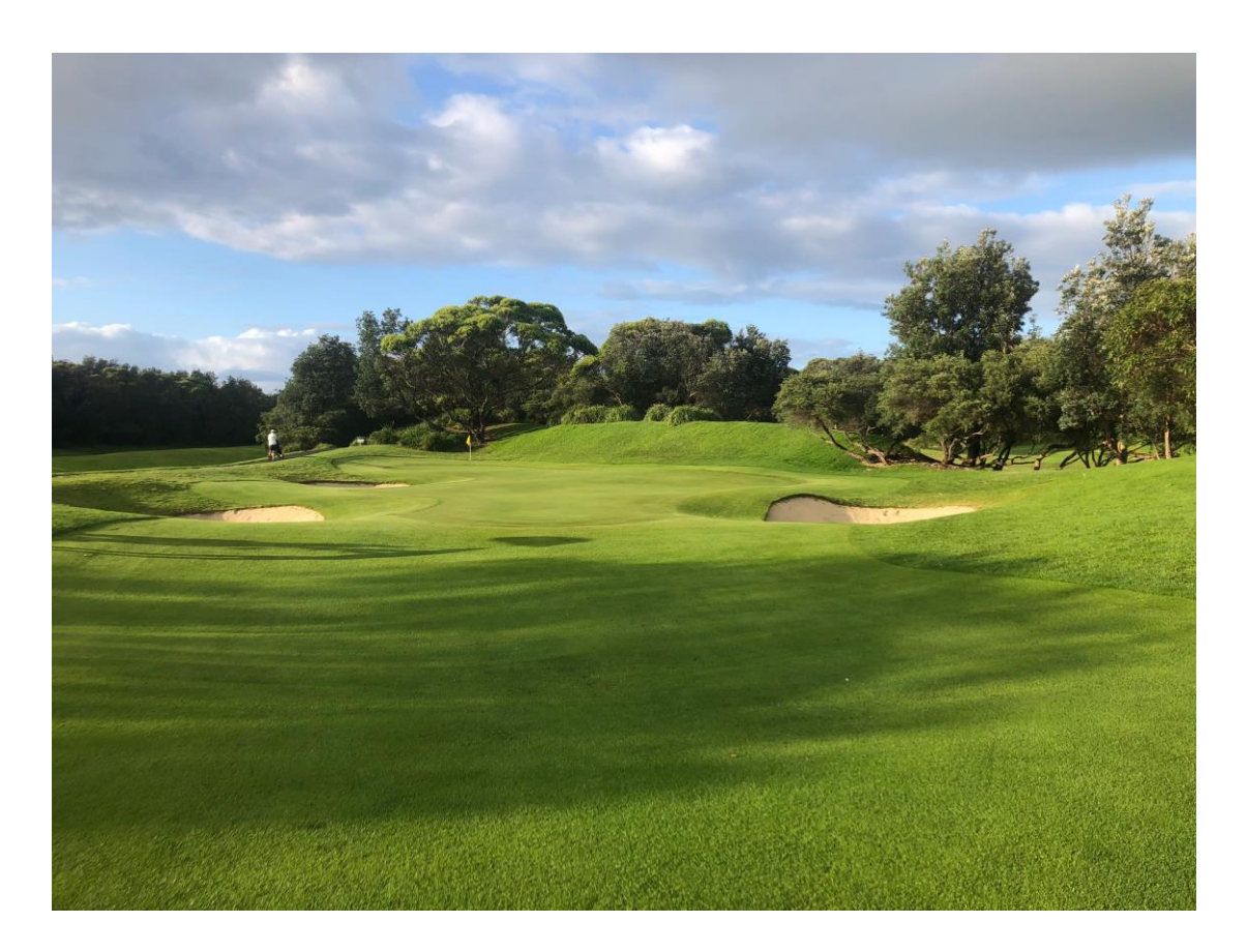
Happy Golfing and all the best for those competing in the 2024 Club Championships!